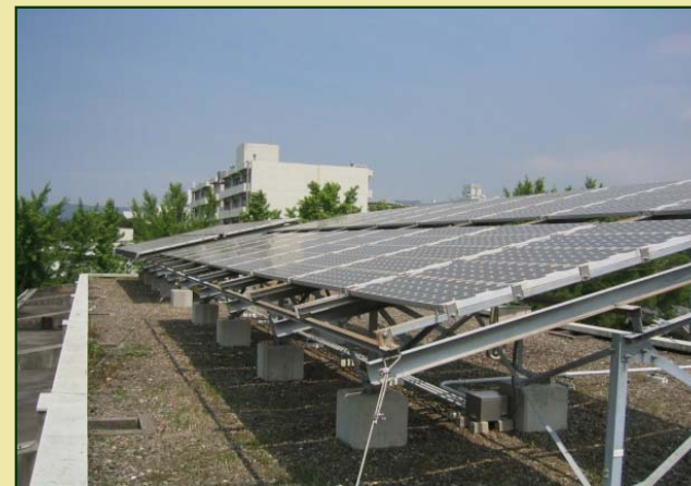
10 kW photovoltaic experimental generation system