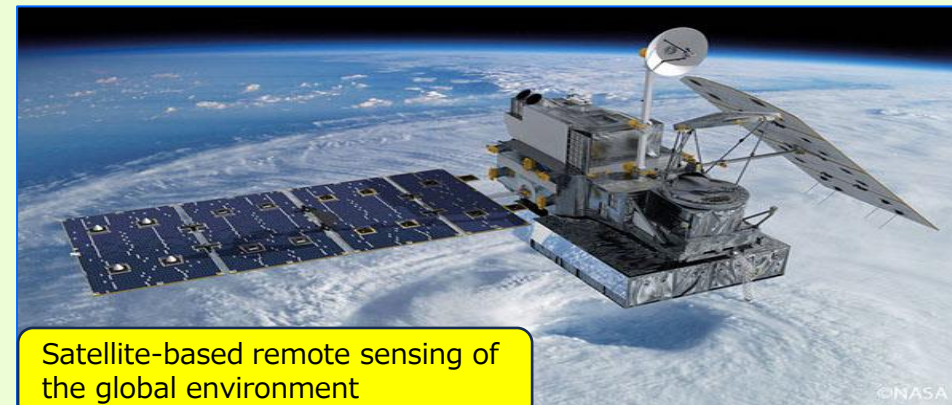
Satellite-based remote sensing of the global environment

Phased-array technology, which electronically scans using multiple antenna elements, enables high-speed, high-density measurements and advances both disaster-prevention applications and basic science.