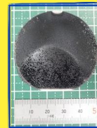
GaN crystal grown by OVPE