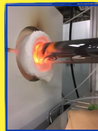
OVPE growth reactor