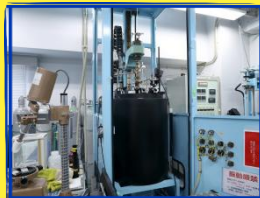
Furnace for CLBO crystal growth