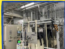
GaN crystal growth equipment for high-temperature and high-pressure condition