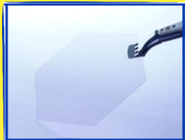
φ 2-inch GaN wafer